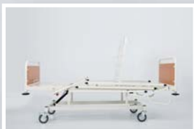
Backrest adjustment : 0 - 65°