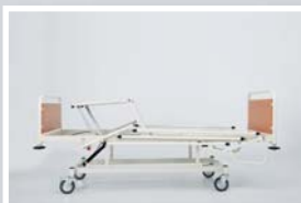
Thigh rest adjustment : 0 - 48°