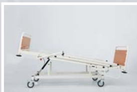
Trendelenburg position : 0 - 12°