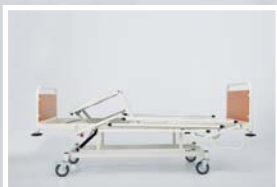
Foot rest mechanical adjustment : 0 - 25°