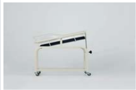
Trendelenburg position : 0 - 14°