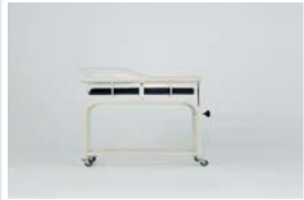
Height : 85,5 cm