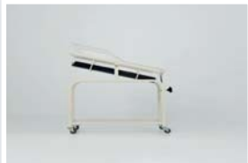
Anti - trendelenburg position : 0 - 14°